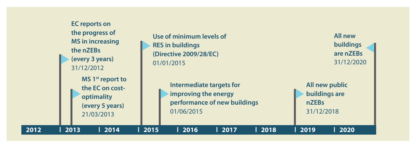
Figure 1 - Key years for nearly Zero-Energy Buildings (Directive 2010/31/EC)

In their national plans, most MS reported on intermediate targets to improve the energy performance of new buildings by 2015. Some countries went further and established measures to deliver a gradual transition towards nZEB levels: