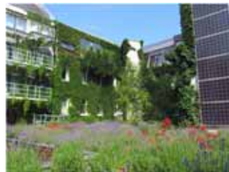
Boutique Hotel Stadthalle Wien, Austria