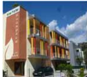
Eco Hotel Bonapace Lake Garda, Italy